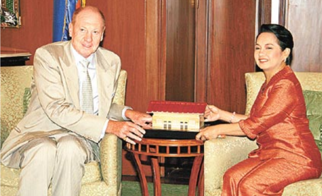
Coca-Cola stays. Coca-Cola Co. chief executive Neville Isdell pays a courtesy call on President Arroyo following the company's announcement that it will stay in Manila. (Story on A6)